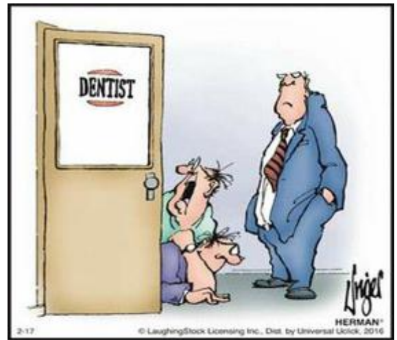
"Grab his legs!"

Husband: My wife is missing. She went shopping yesterday and has not come home! OFFICER: Age? Husband: I'm not sure. Around 40. We don't do birthdays. OFFICER: Height? Husband: I'm not sure. A little over five-feet tall. OFFICER : Weight? Husband: Don't know. Not slim, not really fat. OFFICER : Color of eyes? Husband: Sort of brown I think. OFFICER : Color of hair? Husband: Changes a couple times a year. Maybe dark brown now. I can't remember. OFFICER : What was she wearing? Husband: Could have been pants, or maybe a skirt or shorts. I don't know exactly. OFFICER : What kind of car did she go in? Husband: She went on my motorcycle. OFFICER : What kind of motorcycle was it? Husband : A 2018 Harley Davidson Roadglide, Twisted Cherry with 14" apes, stage 2 kit, Vance and Hines fishtail pipes, Klock Werks windshield, JPCycles foot boards, highway pegs and crash bars...At this point the husband started choking up. OFFICER: Take it easy sir, we'll find your motorcycle.