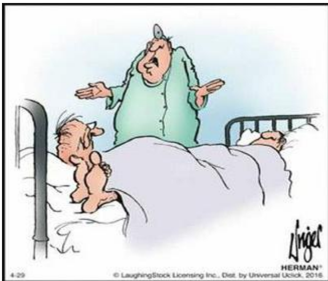
"Look, as soon as a private room becomes available, you'll get one."

Paranoia has reached absurd stages... I sneezed in front of my laptop and the anti-virus started a scan on its own