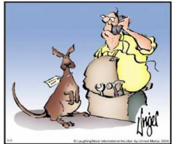
"Why don't you listen? I said, 'Send over a can of glue.'"