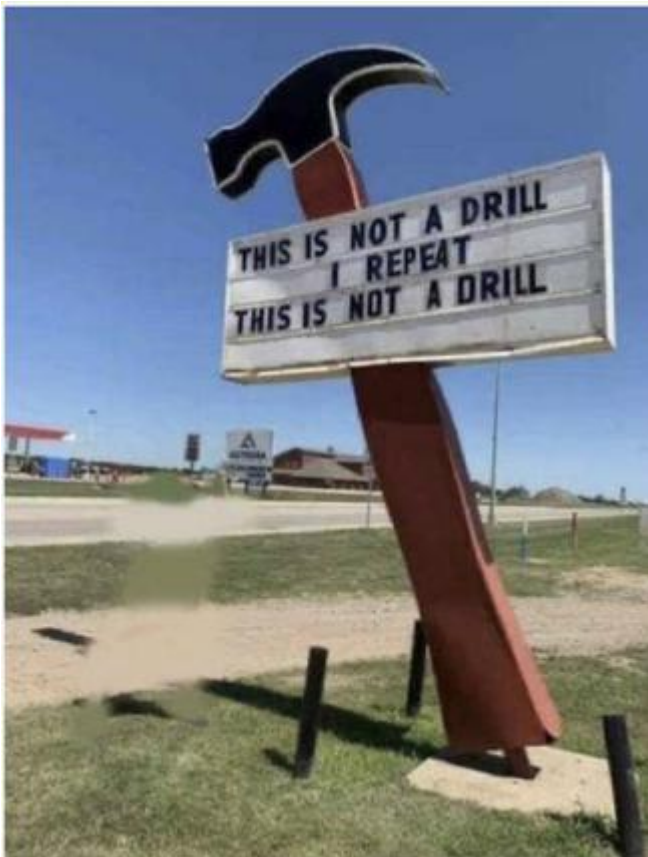
Duchamp eat your heart out!