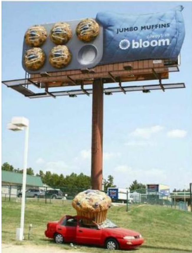
They weren't joking when they said those muffins were big.