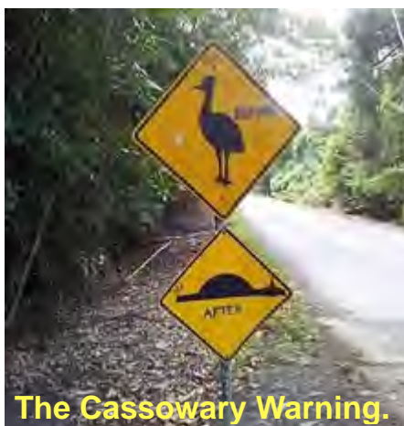
The Cassowary Warning.